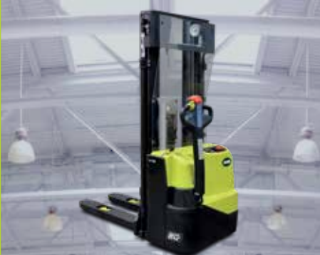
Pallet Stacker 1200 kg