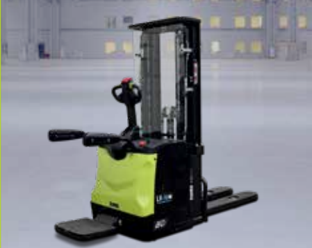
Pallet Stacker Platform version 1600 kg