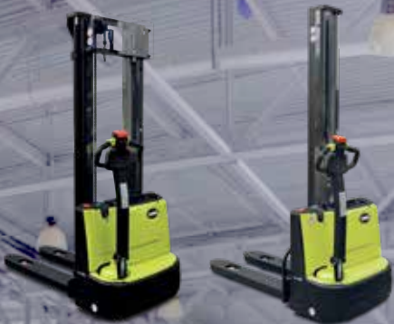
Pallet Stacker 1200 kg