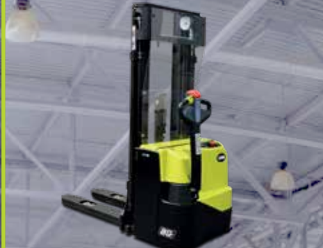
Pallet Stacker 1600 kg