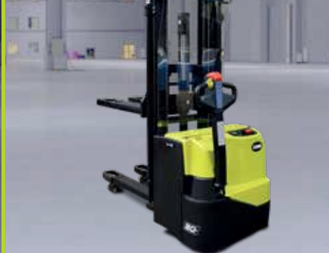
Pallet Stacker 1600 kg