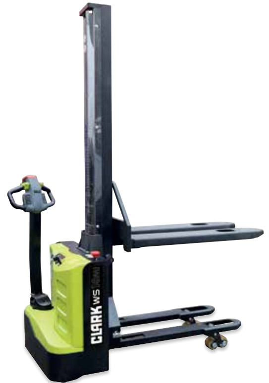
WS10Mi Mono-Mast with initial lift