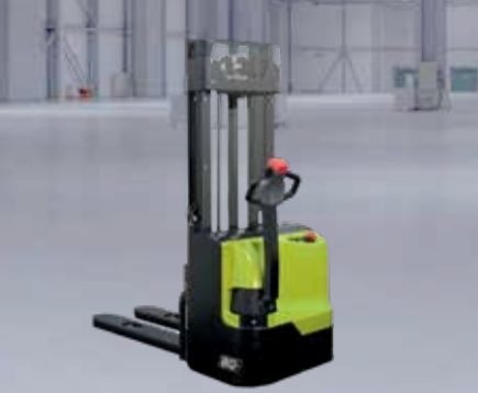
Pallet Stacker Multi-purpose Vehicle 2000 kg